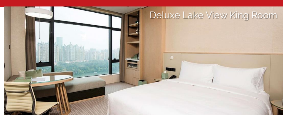
Deluxe Lake View King Room