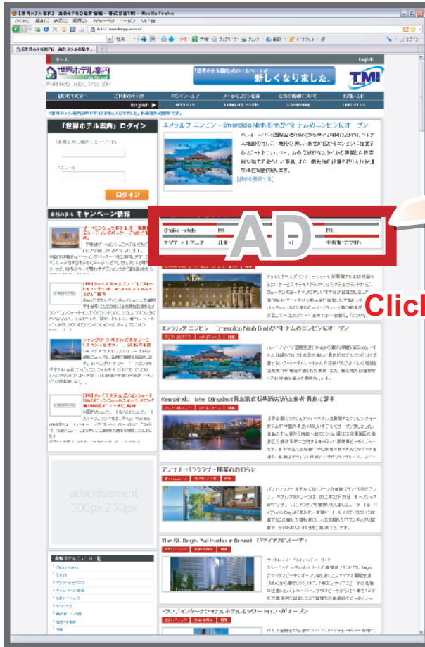
World Hotel Index portal page