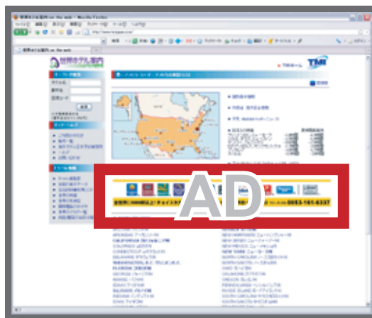
Sample: State listing page