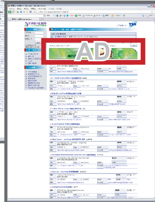
Sample: Hotel listing page

We can design your banner for an extra ¥5,000(JPY). Please provide us with your logo and several photos.