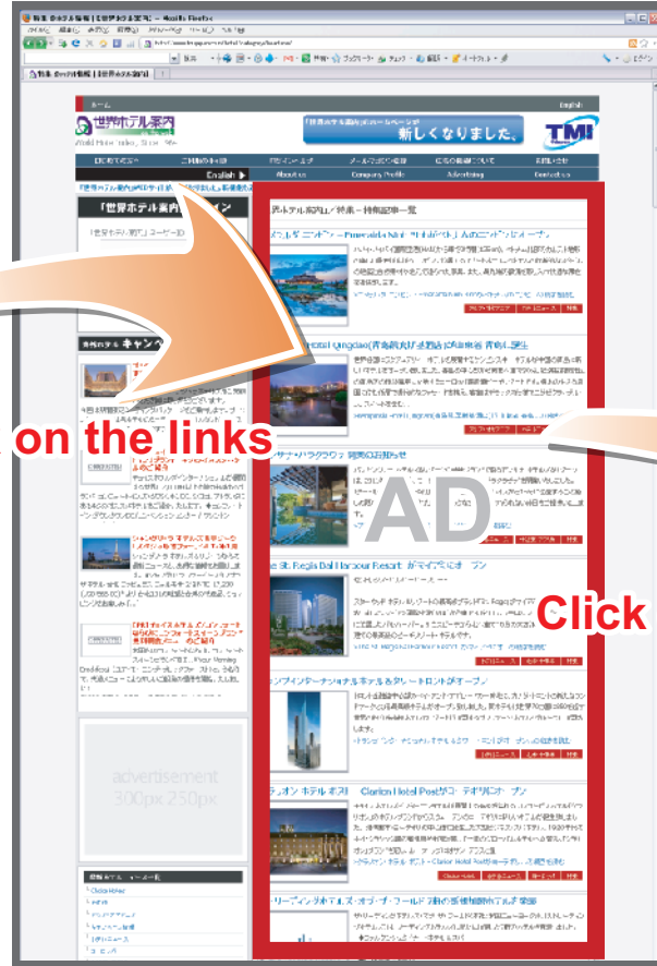
Your news archives