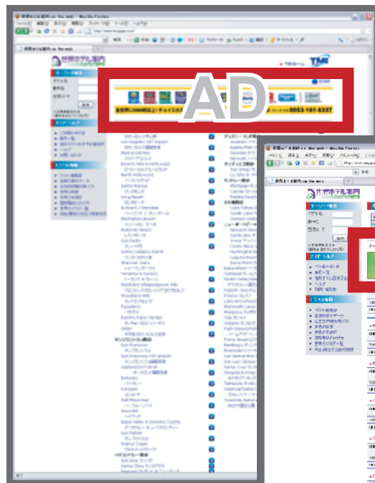
Sample: City listing page